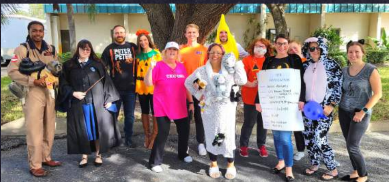
The Holidays are the best time of the year! Our employees never disappoint when it comes to our Annual Halloween Costume Contest (pictured above)! We also passed out our holiday popcorn to all of our employees for Christmas (pictured to the right).