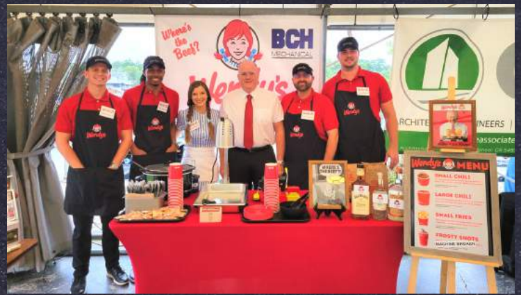
Our Estimating and Sales team had so much fun at the ABC Florida Gulf Coast Chapter Chili Cook-off last week! When we commit to a theme, we REALLY commit! Thank you to those who stopped by our table and shared a laugh with us!