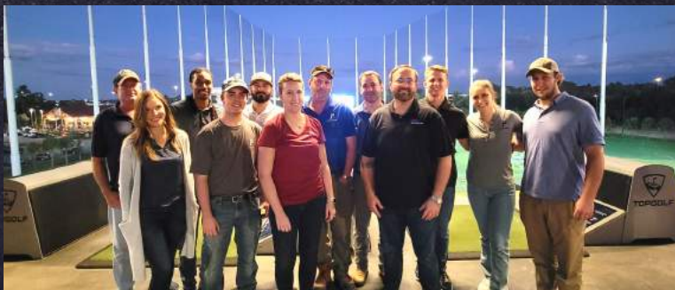
Our Estimating and Sales team enjoyed a night at TopGolf in Tampa with the awesome crew from The Perry Company back in December!