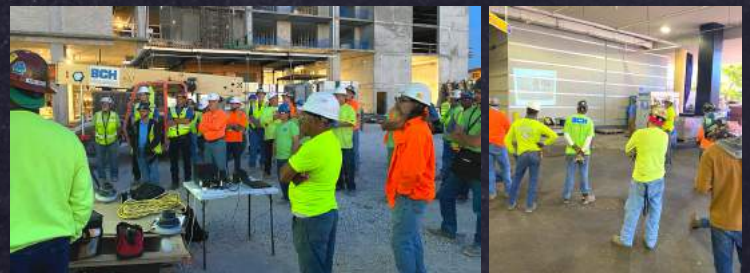
BCH Mechanical hosted a Safety Stand Down at several job sites the last few months and will continue to host safety activities like these. A Safety Stand Down is an opportunity to talk directly to employees about the many facets of safety - job hazards they face, protective methods, and the company's safety policies and goals. Staying committed and involved keeps our workplace and worksites actively working to achieve a harm-free environment.