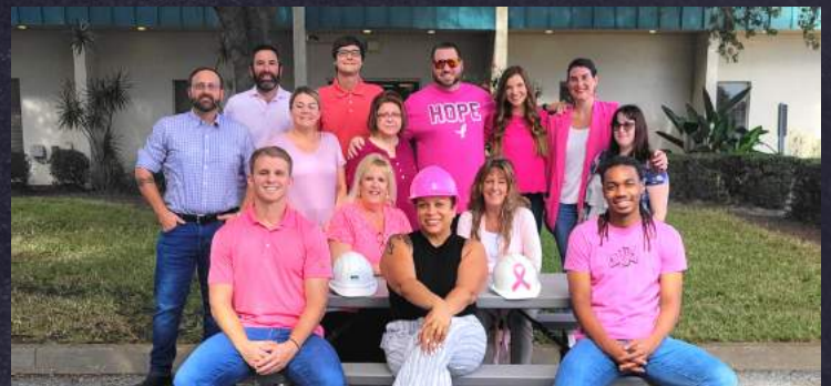
Our Largo team went PINK in October to honor survivors, remember those lost to the disease, and to support the progress we are making together to defeat breast cancer!