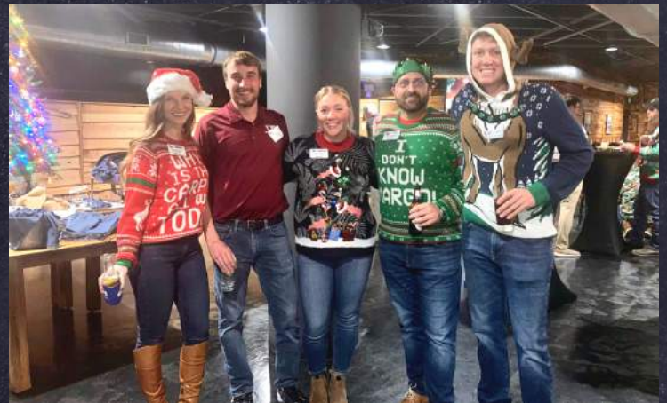
Some of our ABC Young Professional members enjoyed the Ugly Sweater Happy Hour. This YP group also collected toys for Mary Lee's House to help bring some joy to kids in need this year!