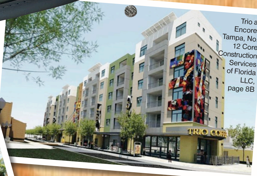
Trio at Encore, Tampa, No. 12 Core Construction Services of Florida LLC, page 8B