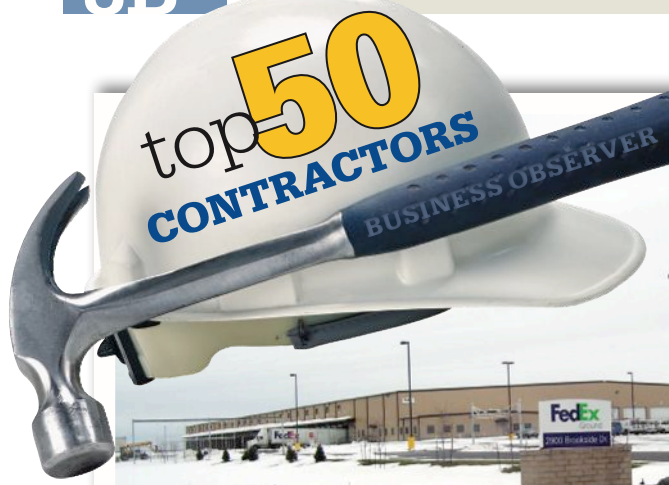
FedEx Ground Distribution Center, Des Moines, Iowa