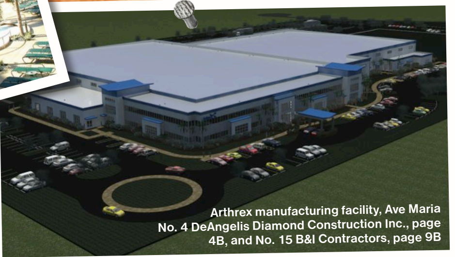
Arthrex manufacturing facility, Ave Maria No. 4 DeAngelis Diamond Construction Inc., page 4B, and No. 15 B&I Contractors, page 9B