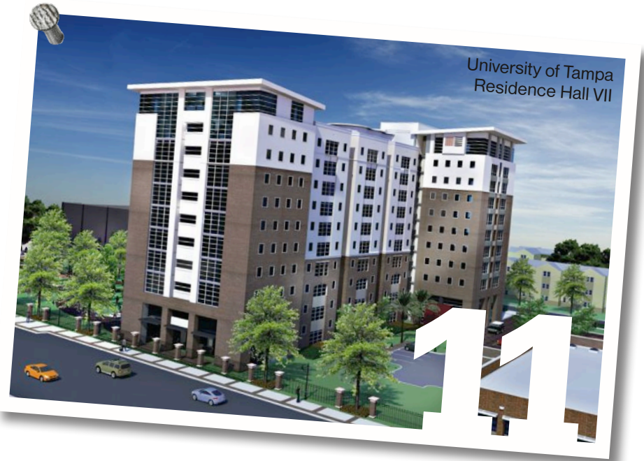
University of Tampa Residence Hall VII