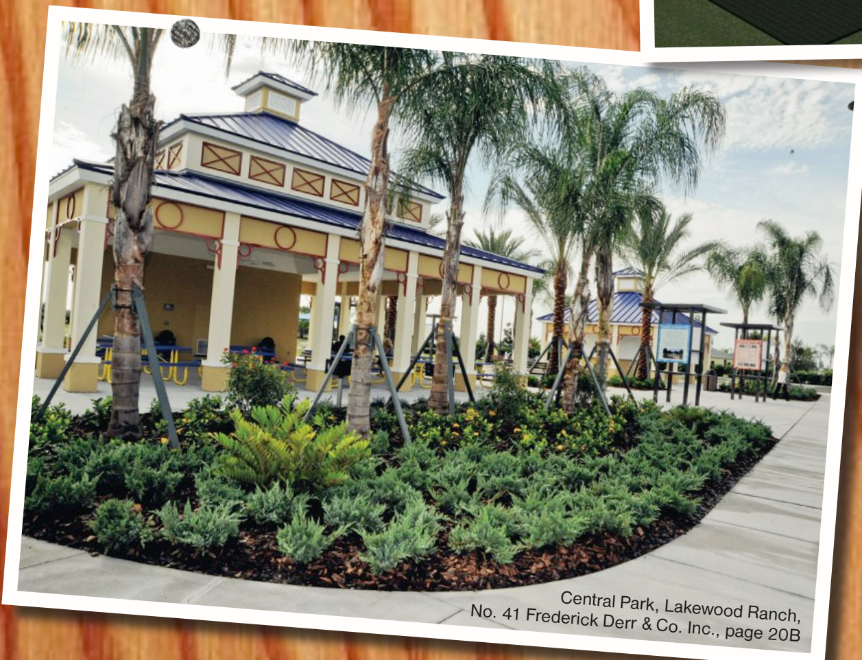
Central Park, Lakewood Ranch, No. 41 Frederick Derr & Co. Inc., page 20B