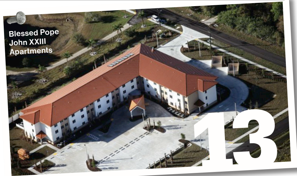
Blessed Pope John XXIII Apartments