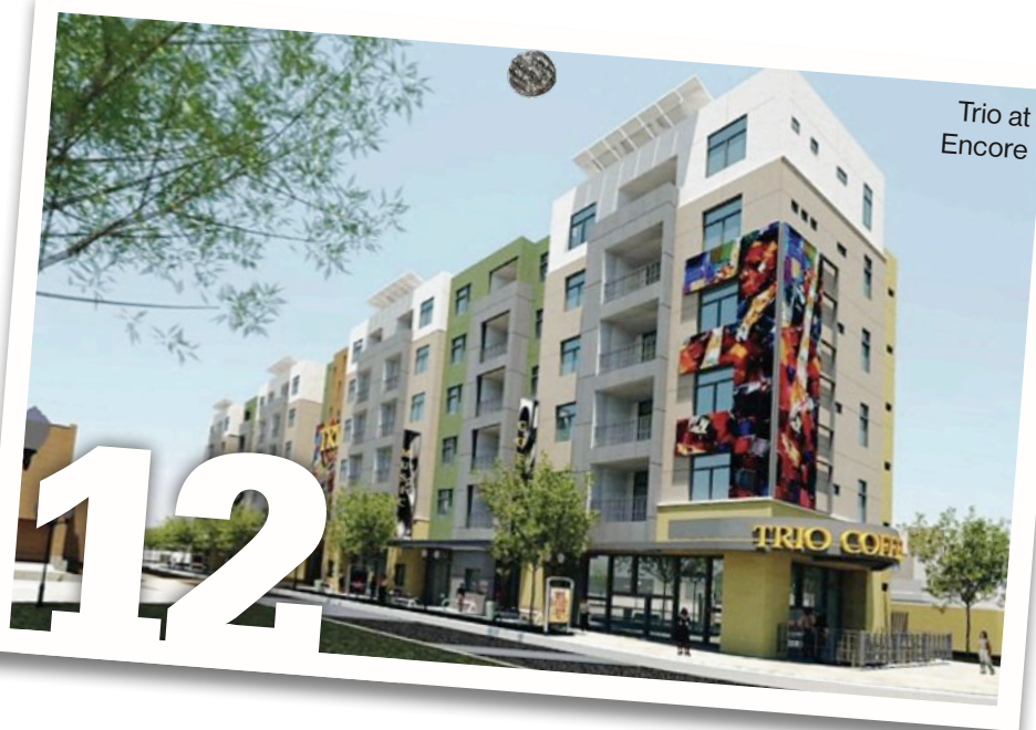
Trio at Encore